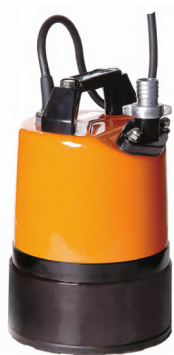
LSC1.4S 25mm outlet