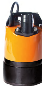
LSC1.4S 50mm outlet