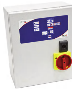
Switch 2 O with Control Panel