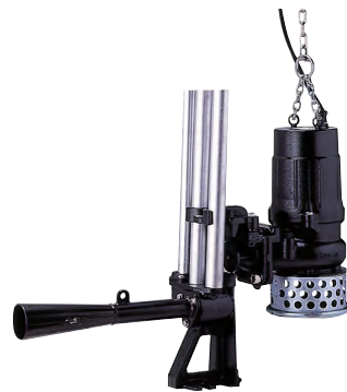
TOS Auto Coupling