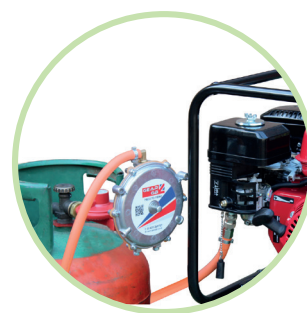
LPG conversion kit